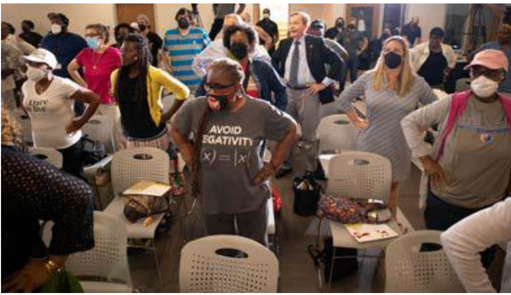
PATIENTS Day attendees enjoy a stretch break