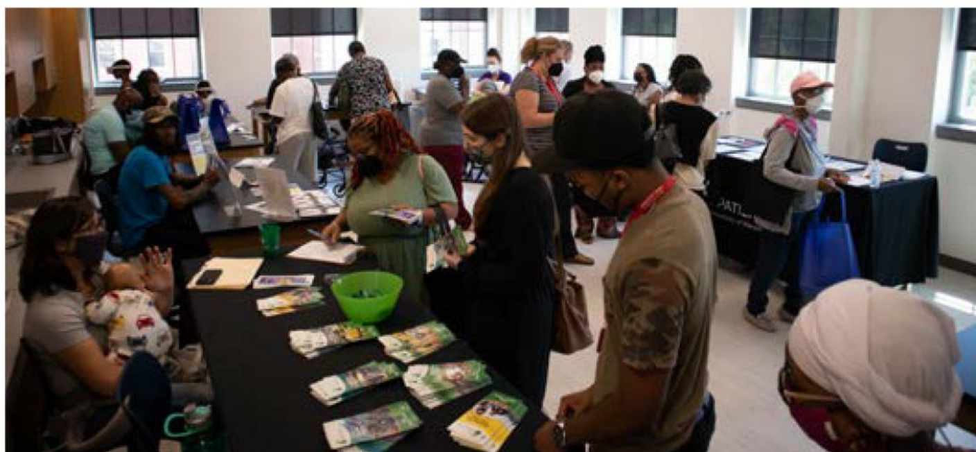
Attendees visit the health fair

Check out this short video that celebrates the collaborative spirit of PATIENTS Day!