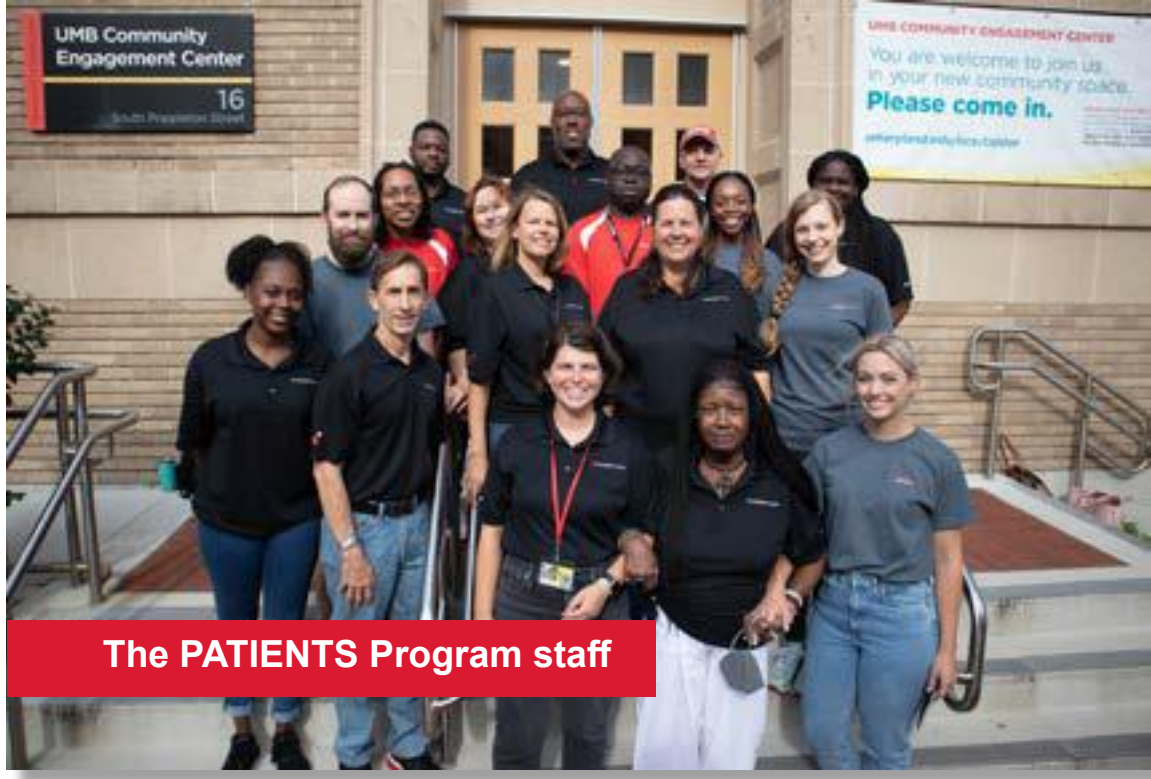
The PATIENTS Program staff